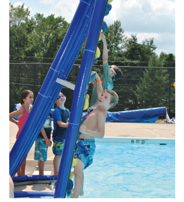
The Aqua Climb tests energetic and athletic youngsters

Popular among teen and adult demographics, the award-winning system tilts over the water, ensuring swimmers' descent is away from the wall and pool edge.