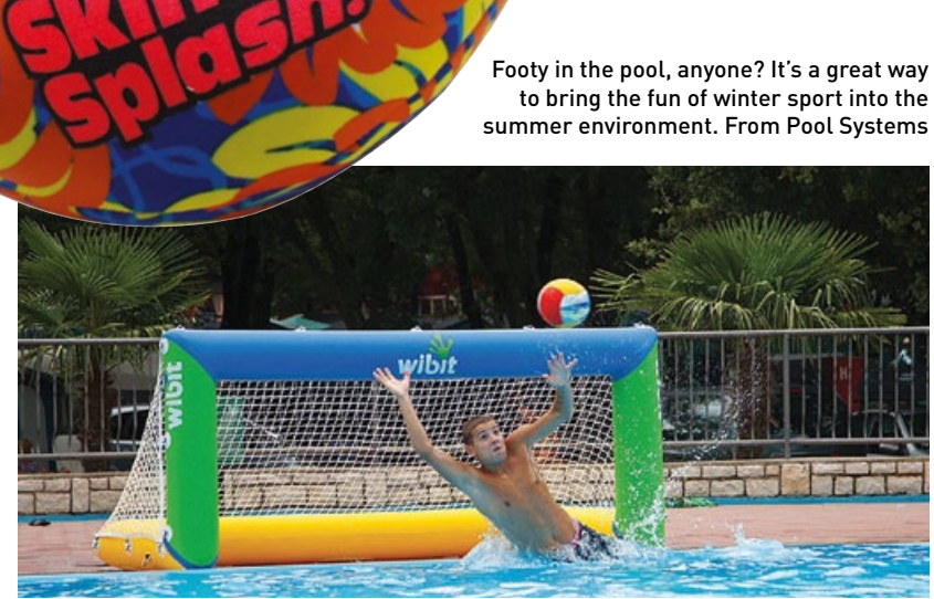
Practice water polo skills and have even more fun in the pool with the Wibit inflatable pool goal from Hydrocare