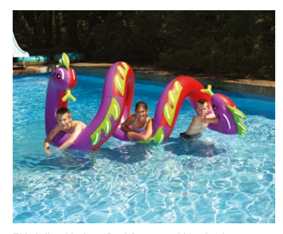
This inflatable from Pool Systems abides by the rule - whatever else, it must be fun

This vertical modular system, which is currently being used in roughly 350 North American facilities to increase attendance rates and re-engage patrons, features five climbing panel options that start off at entry level and extend through to a canyon-quality surface.