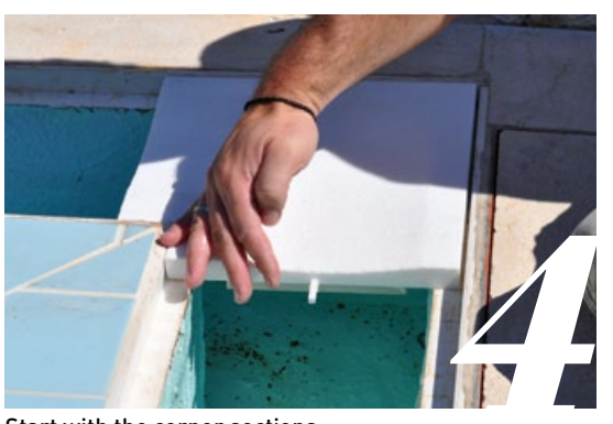
Start with the corner sections