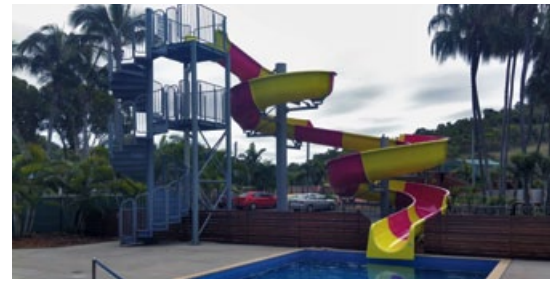
Even small resorts can benefit from a water slide, this one is from \operatorname{Swimplex}