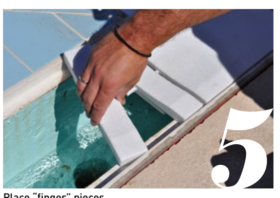
Place "finger" pieces