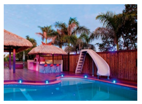
The Wild Ride slide from Aqua Action