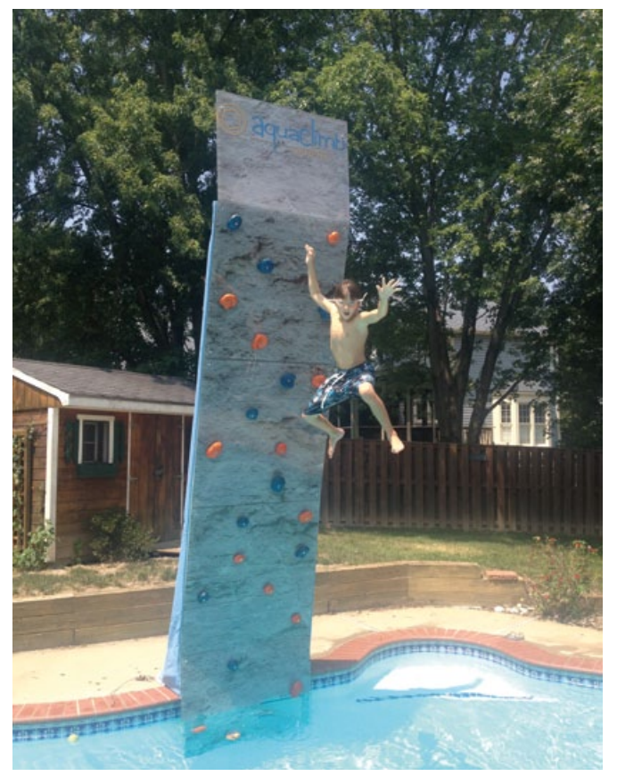
A residential version of the AquaClimb

"The water play area uses more than 2000 water jets, and a sixth of them are computer controlled interactive jets designed to attract attention day and night," he says.