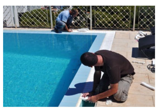
Two men are better than one