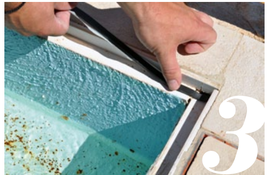
Adhere the anti-vibration tape to the ledge