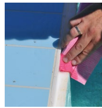
Throroughly clean the ledge