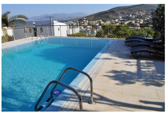
This pool in Saronida, 50km south of Athens, originally had a plastic grate