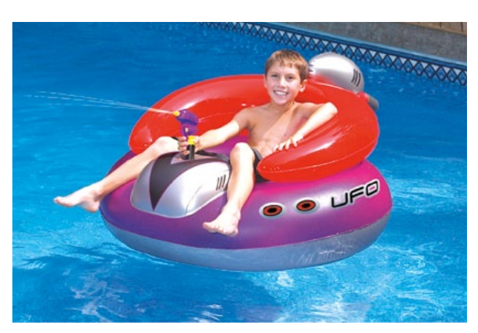
Armed but not dangerous: the UFO from Pool Systems

Their top of the range is the 360-degree G-Force slide, and it also takes riders up to 113kg. The difference is the high power water sup-