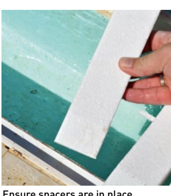
Ensure spacers are in place