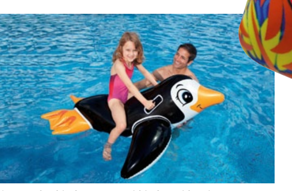
A penguin ride for younger kids from Lincoln